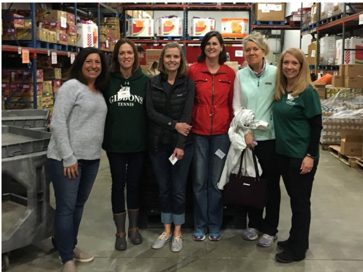
Cardinal Gibbons Moms volunteering in Feb.

I invite you to join in the fight against poverty, both material and spiritual. Together let's build peace and bridges of friendship.